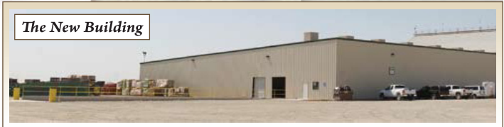
The New Building

A major gas explosion destroyed the Harris garlic processing facility, killing one employee and destroying the building, an old cotton gin, and the company's processing line. Tunnels below ground were partially damaged and most of an eight-inch slab above the tunnels was damaged or destroyed. Harris was in jeopardy of losing an entire garlic packing season. Insurers for Harris proposed a settlement of approximately $500,000. Adjusters International was retained and settled the claim for more than $2 million.