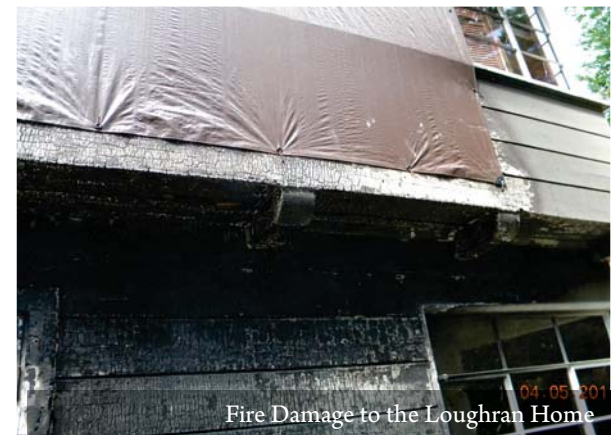
Fire Damage to the Loughran Home