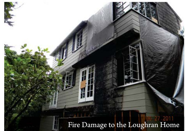
Fire Damage to the Loughran Home